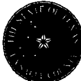
La Salle County